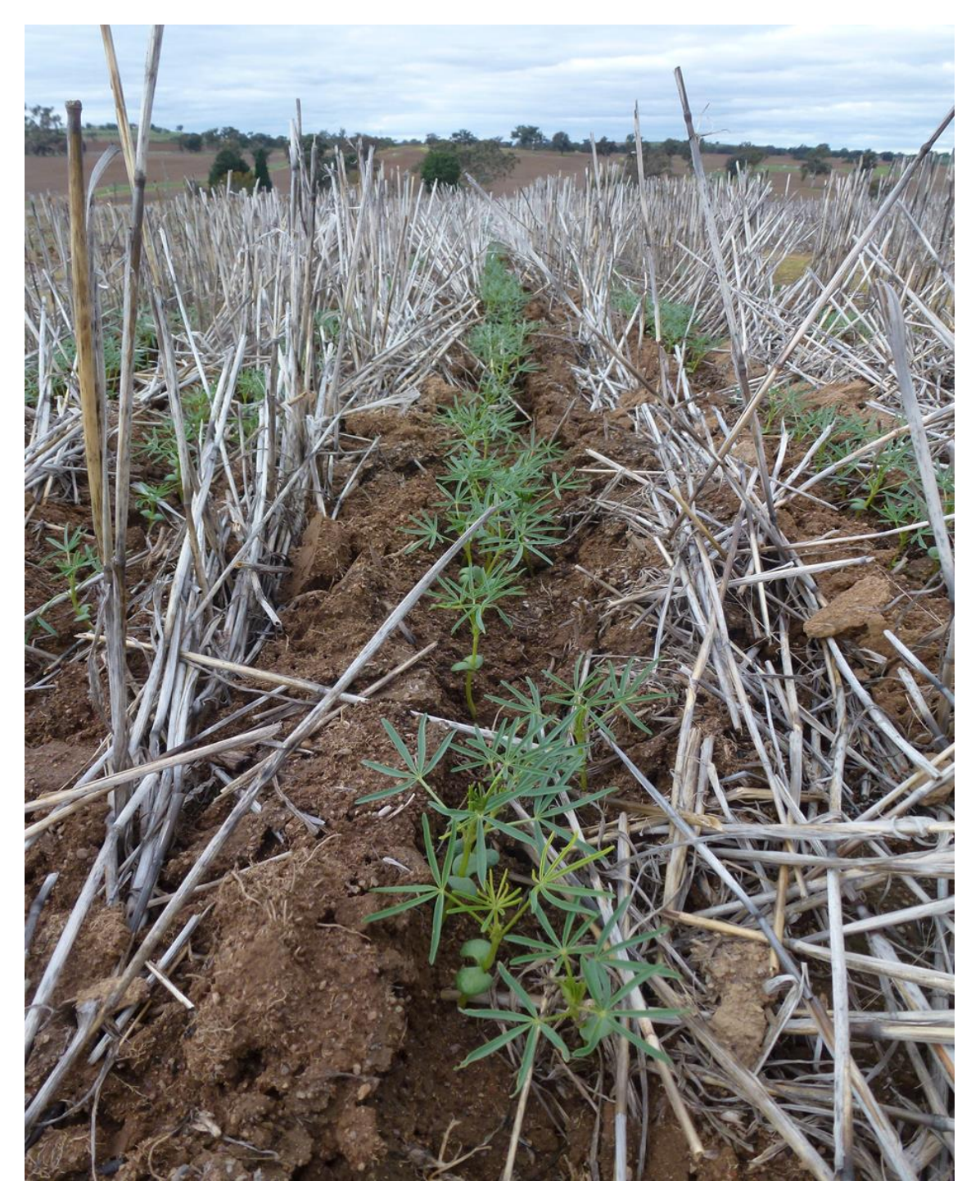
Lupin crop sown inter-row by no-till into standing wheat stubble – three pillars of conservation agriculture